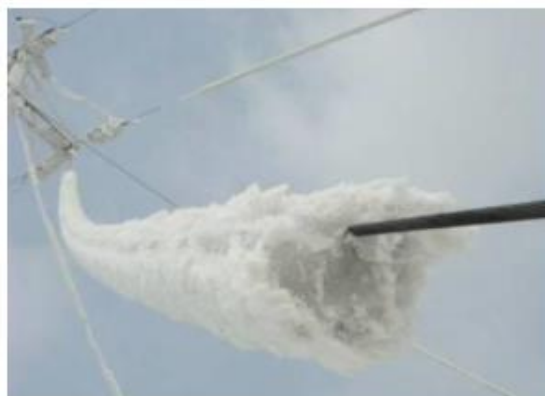
Figure - 1 – Typical ice formation on a power transmission line conductor Compiled by the authors based on [2]

The typical mass of ice accumulation on electrical conductors and cables is determined based on a cylindrical deposit formation with a density of 0.9 g/cm 3 (Figure 1).